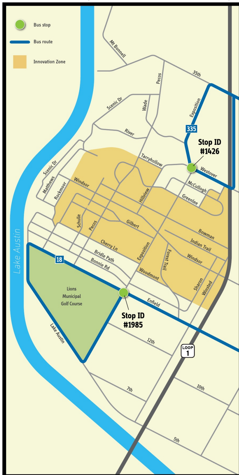
Exposition Innovation Zone Map

To take advantage of the program, download the RideAustin app and use the app to book a ride from one of the two stops to anywhere inside the Exposition Innovation Zone or from anywhere in the zone to the two stops.