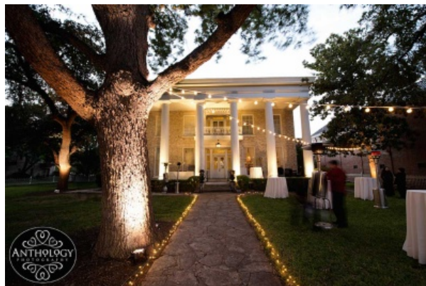
Neill Cochran House

Registration is limited. Registration: $30. Includes wine, beer, tea, coffee and water. FREE on-site parking; accessible.