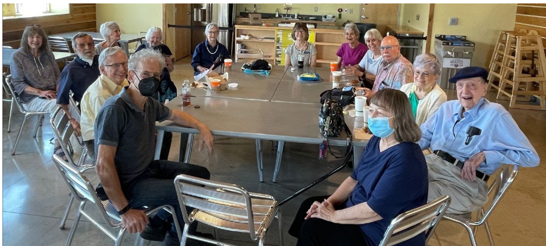
Fourth Sunday Group

The popular South Austin event "Fourth Sunday at Wheatville" will switch to every third Sunday in 2023. This presents fewer holiday and other conflicts for the group, who are having a great time getting together in South Austin.