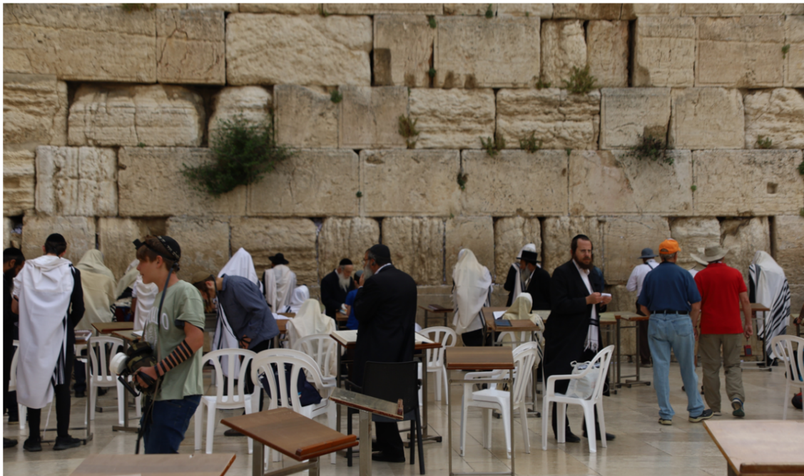
Western Wailing Wall