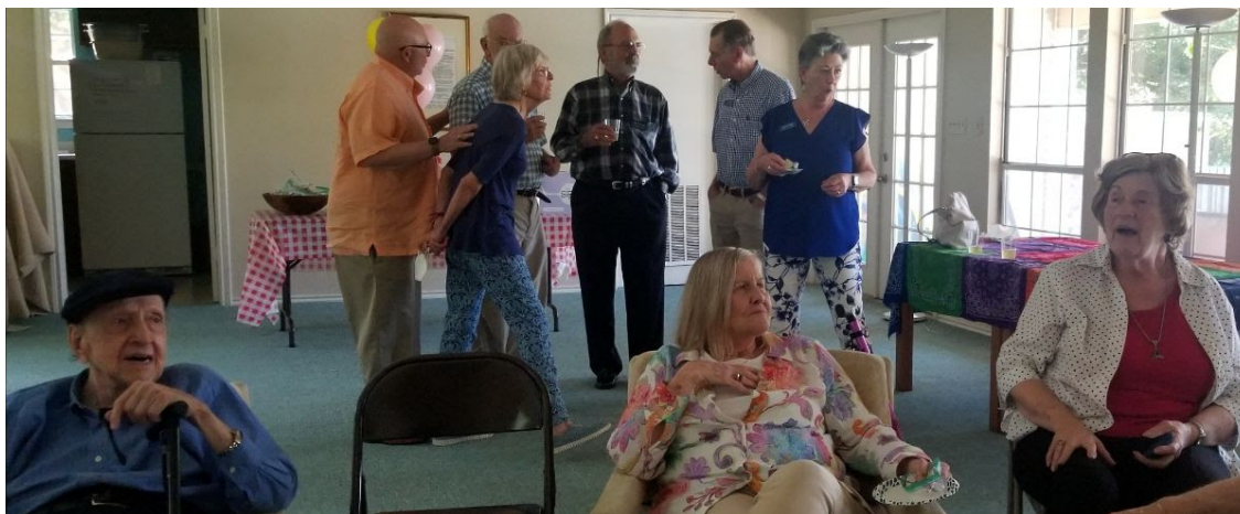
May Reception for Our New Executive Director